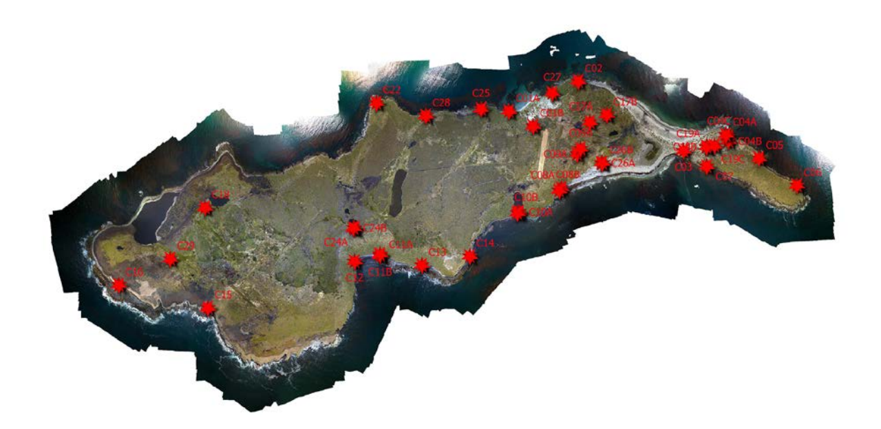
Figure 2 - Map of caracara nest locations. This is a summary of the position of all 35 caracara nests observed during the seven seasons of the study. Each of the 27 pairs observed during the study occupied one to three nests.