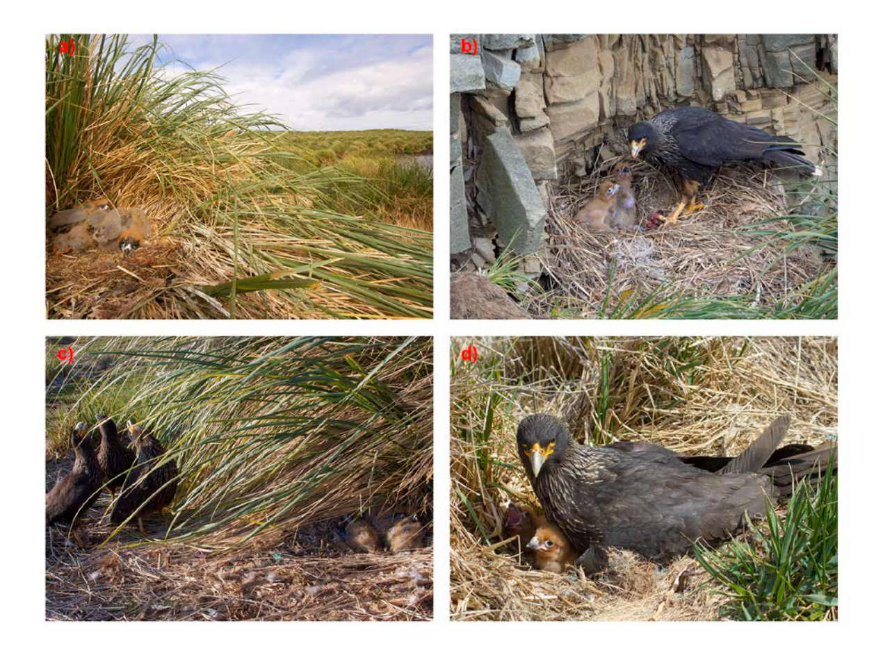
Figure 3 - A sample of caracara nests. a) Nest on top of tussac grass overlooking a pond; b) Nest on a steep cliff without tussac grass cover; c) Nest on the ground with tussac grass cover (note the trio of displaying striated caracaras); d) Nest on the ground without tussac grass and with no cover.

and moulting groups); 17.14% of the nests were located close to gentoo penguin ( Pygoscelis papua ) breeding colonies; none of the nests was located close to the rockhopper penguin ( Eudyptes chrysocome ) colonies of the Sheffield Memorial area (this area was within the territory of pair C21 that never bred); most pairs (90.63%) nested close to areas of very high density of Magellanic penguin ( Spheniscus magellanicus ) burrows (please note that Magellanic burrows are present on most areas of the island excluding the diddledee patches of the interior); only one pair nested close to the main imperial shag ( Leucocarbo atriceps ) breeding colony; 80.00% of the nests were close to cliffs with a high density of rock shag ( Phalacrocorax magellanicus ) nests. A sample of nests located in different habitats is shown in Figure 3.